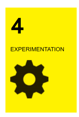
I have an idea. How do I build it?