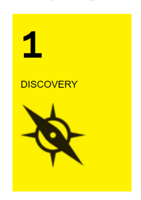
I have a challenge. How do I approach it?