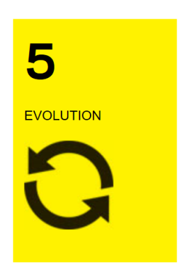
I tried something. How do I evolve it?