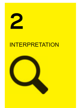
I learned something. How do I interpret it?