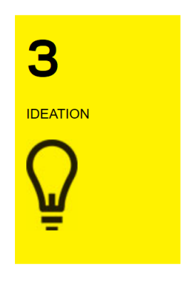
I see an opportunity. What do Lcreate?